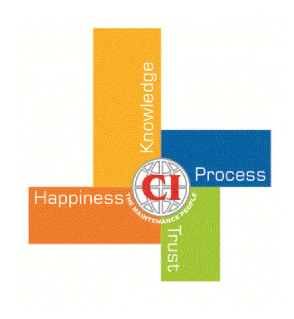
"Committed to provide Customer Satisfaction by measuring customer perception"